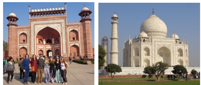
WU students at the Taj Mahal.

Everywhere they went in India people were extremely nice, cooperative and helpful. The India Experience participants members were able to experience India's diversity, multilingual and multicultural nature and the merging of tradition, technological and economic advancement.