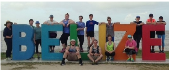
Washburn students in Belize during winter break.