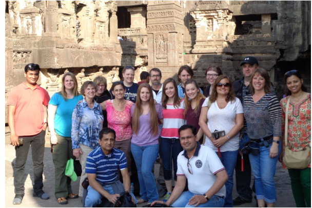
2016 Winter Break participants of the WU India Experience study abroad program.